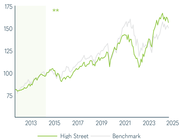
Benchmark: 1/3 Equity (MSCI ACWI Index), 1/3 Property (EPRA/NAREIT Developed Index), 1/3 Bonds (Barclays Global Index)